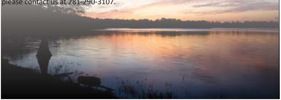
Kings Manor Municipal Utility District

Our drinking water is obtained from groundwater sources. Our water comes from the Evangeline aquifer. TCEQ completed an assessment of your source water, and results indicate that some of our sources are susceptible to certain contaminants. The sampling requirements for your water system are based on this susceptibility and previous sample data. This information describes the susceptibility and types of constituents that may come into contact with your drinking water source based on human activities and natural conditions. The information contained in the assessment will allow us to focus our source water protections strategies. This source water assessment information is available on Texas Drinking Water Watch at dww2.tceq.texas.gov/DWW/. For more information on source water assessments and protection efforts at our system, please contact us at 281-290-3107.