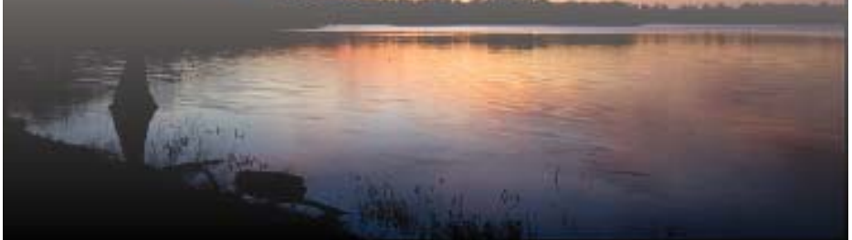
Fort Bend County Municipal Utility District No. 50

Our drinking water is obtained from groundwater and surface water sources. Our groundwater comes from the Evangeline aquifer and our surface water comes from the Trinity River via the North Fort Bend Water Authority (NFBWA). TCEQ completed an assessment of your source water, and results indicate that some of our sources are susceptible to certain contaminants. The sampling requirements for your water system are based on this susceptibility and previous sample data. This information describes the susceptibility and types of constituents that may come into contact with your drinking water source based on human activities and natural conditions. The information contained in the assessment will allow us to focus our source water protections strategies. This source water assessment information is available on Texas Drinking Water Watch at dww2.tceq.texas.gov/DWW/. For more information on source water assessments and protection efforts at our system, please contact us at 281-290-3107.